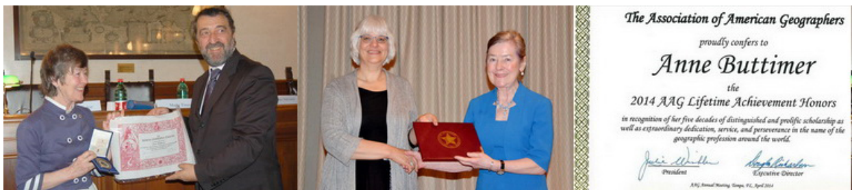
Right, Rome: Award from the Società Geografica Italiana (2007)