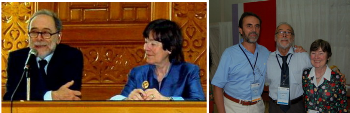
Left, 2006: in Egypt, to sustain the Vallega Project CCHD (later become IYMU).