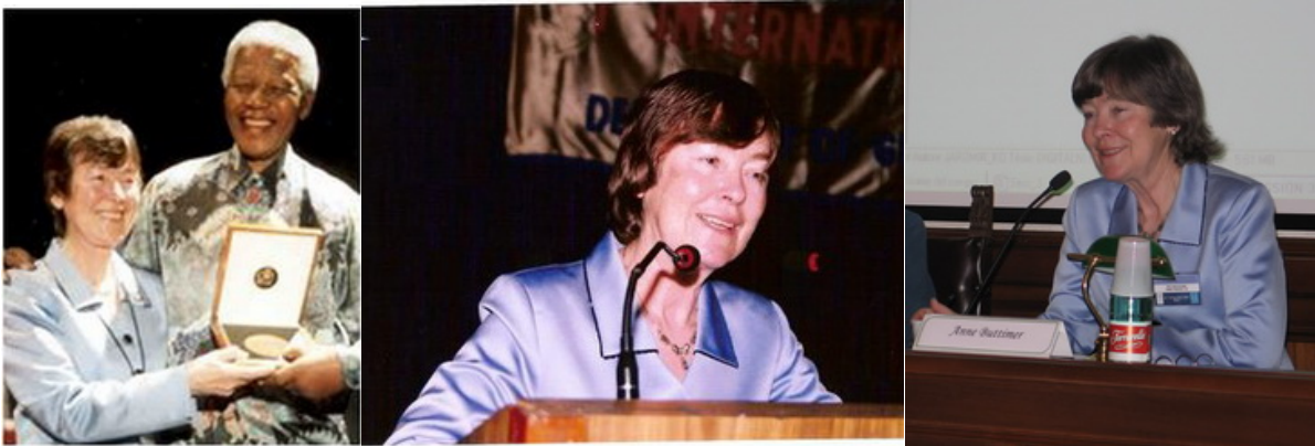
Left, 2002: Durban, Awarding Nelson Mandela Madiba; Center-right, chairing Sessions: 2005, in Hyderabad and in Rome.

election, I had the chance to meet her again several times, discovering nice character traits and taking several photos. Look at her face, she is never bored, and always expressing something: if not happiness, it is interest.